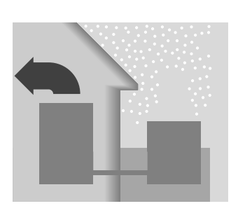
It heats in winter.