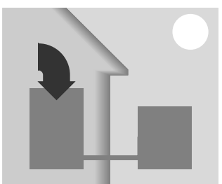
It cools in summer.

A heat pump is not a household appliance. It's a self-contained system that requires professional maintenance and repair.